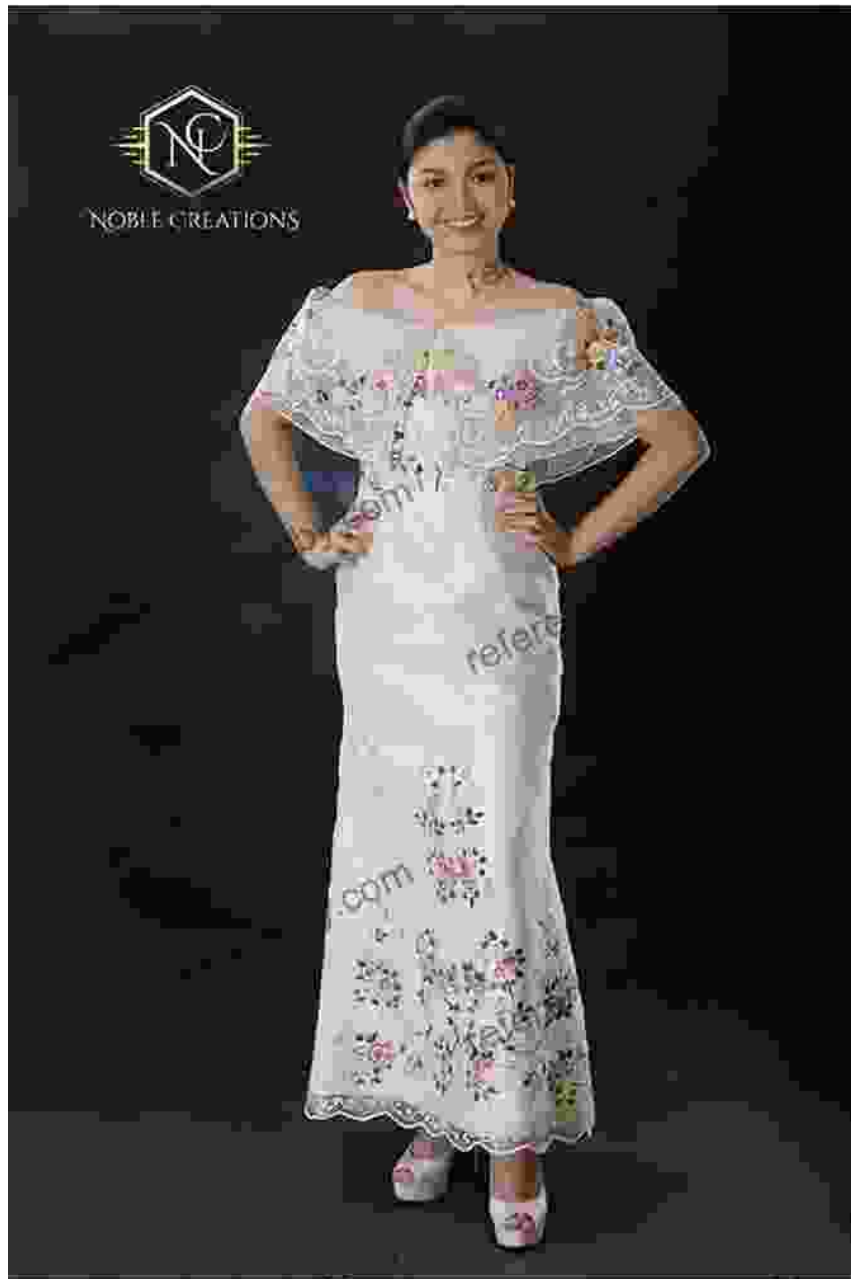
Contemporary gown combining traditional embroidery and modern materials

The book showcases designs that combine traditional techniques with innovative materials, creating a unique blend of old and new. For example, one designer has created a contemporary gown using intricate embroidery inspired by historical textiles, while another has incorporated 3D printing technology into a garment that pays homage to the Bauhaus movement.