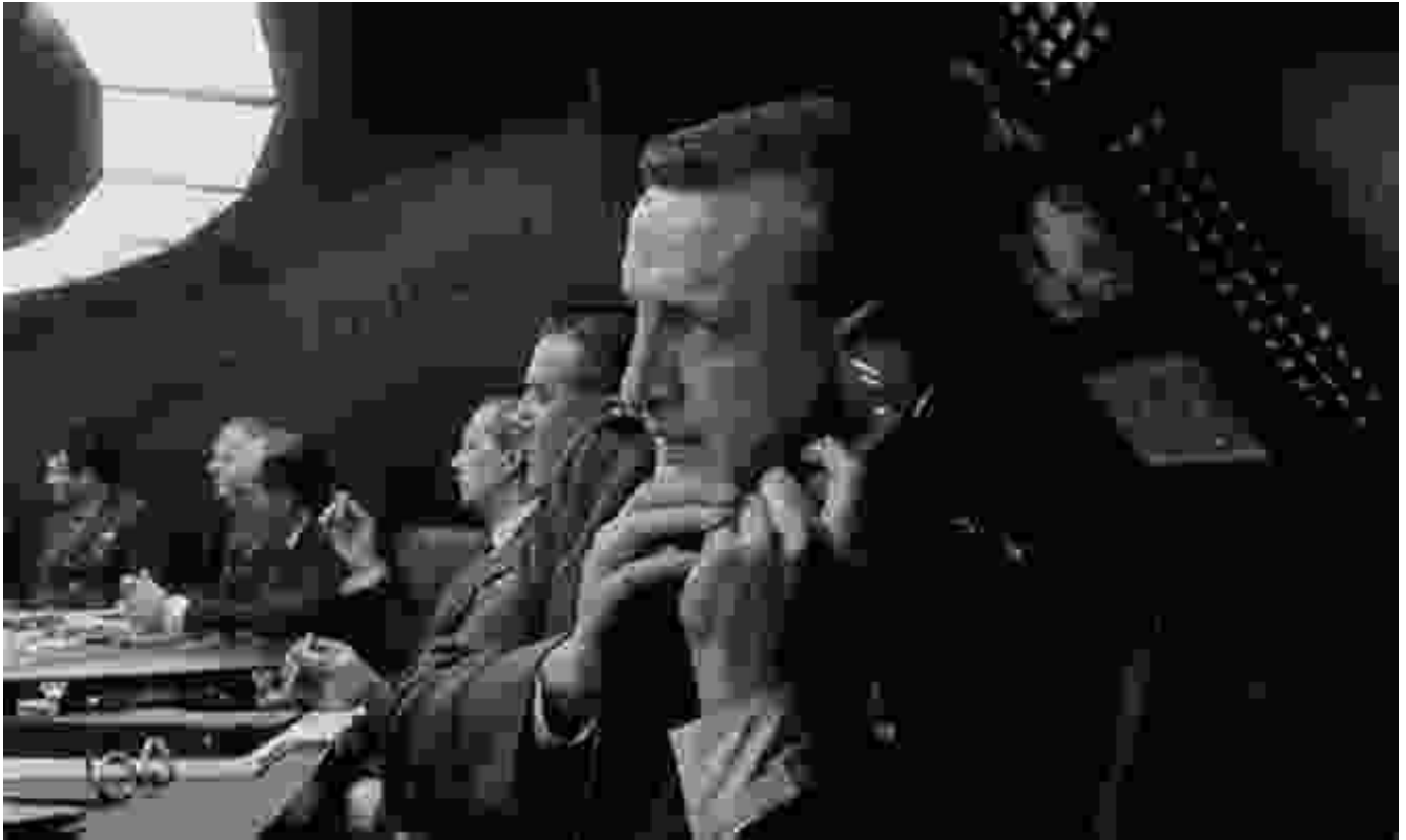
8. The Cabinet of Dr. Caligari (1920)