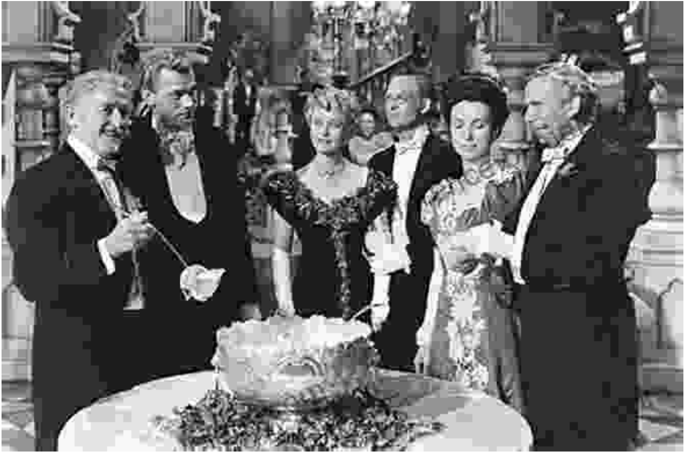
2. The Third Man (1949)