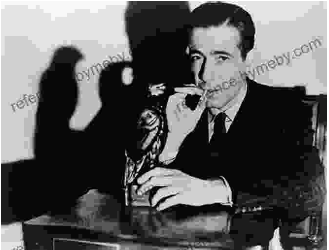
6. Rear Window (1954)