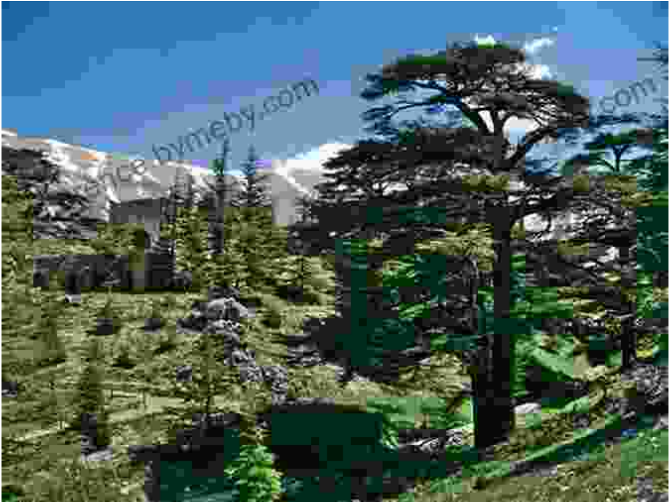
The Cedars of God in Lebanon