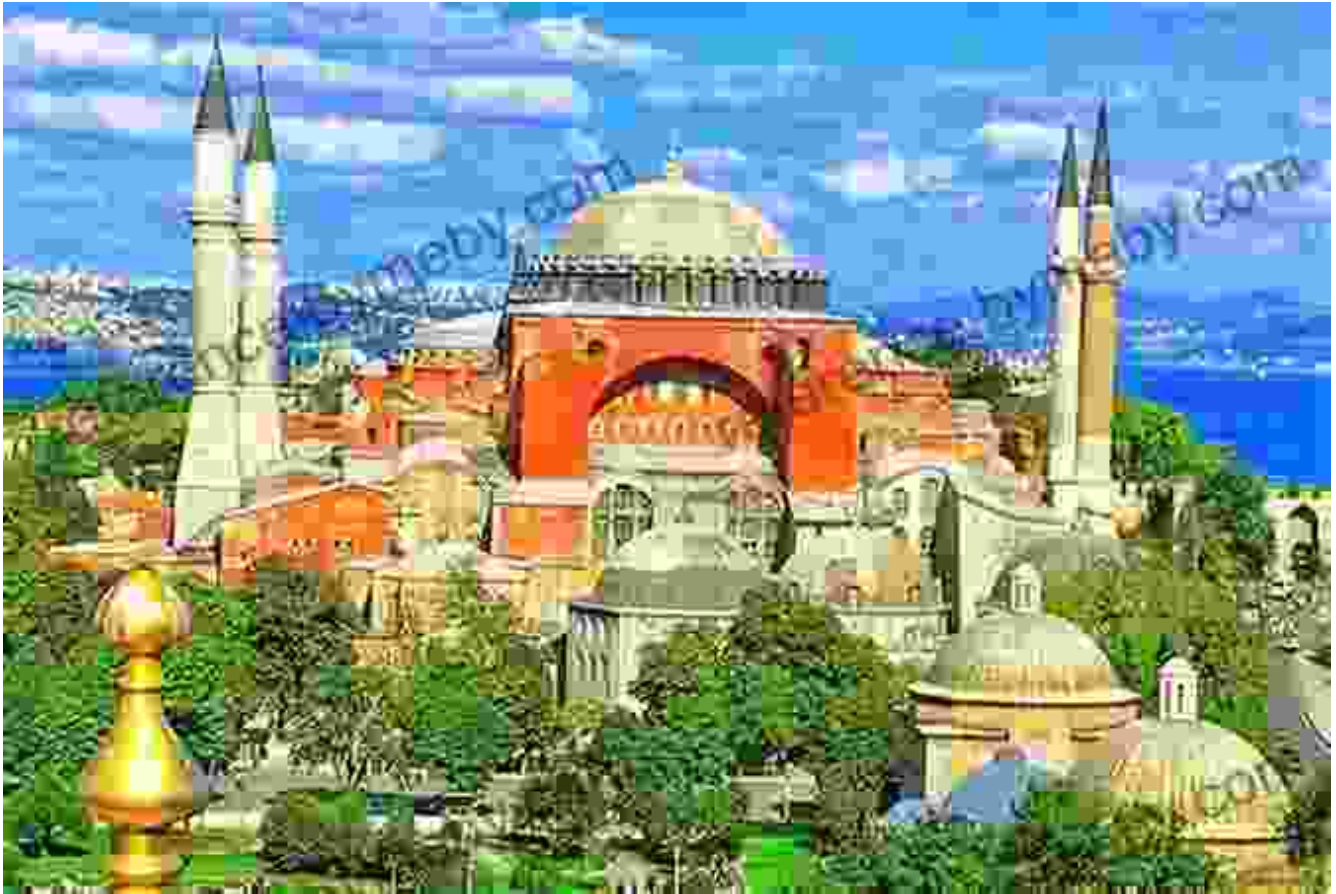
The Hagia Sophia in Istanbul, Turkey

This book is an essential read for anyone who is interested in learning more about the rich history, diverse cultures, and awe-inspiring landscapes of France, Egypt, Palestine, Lebanon, Syria, and Turkey. The author's vivid descriptions, stunning photography, and insightful cultural commentary will transport you to these fascinating countries and leave you with a deeper understanding of their people and their way of life.