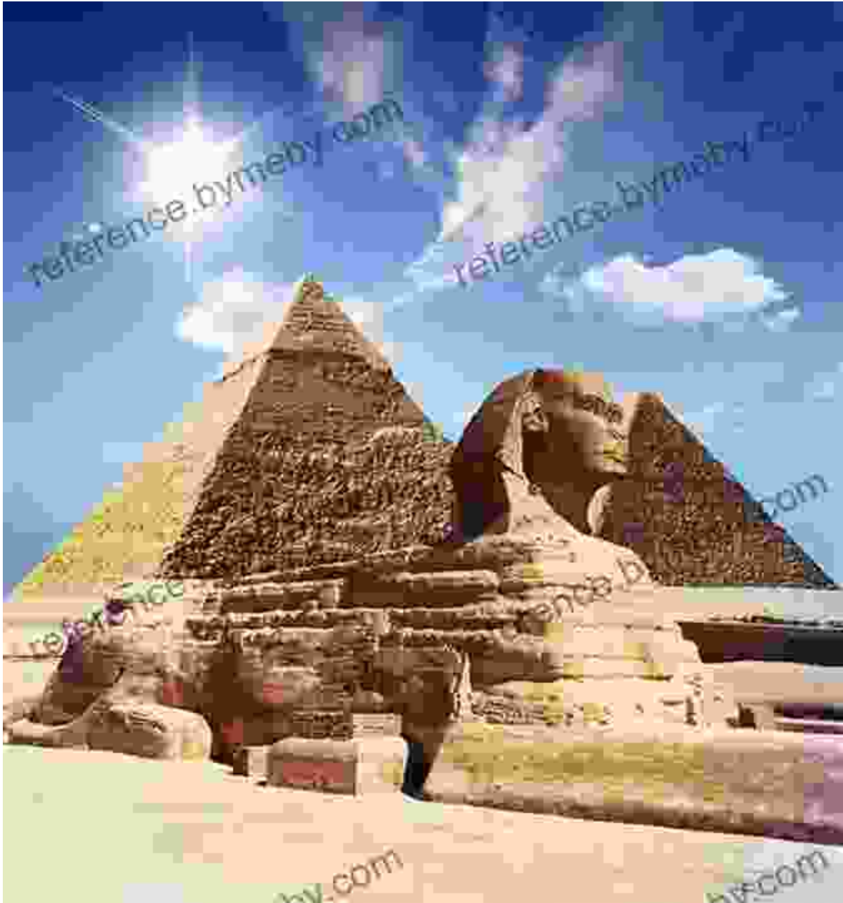
The Pyramids of Giza in Egypt