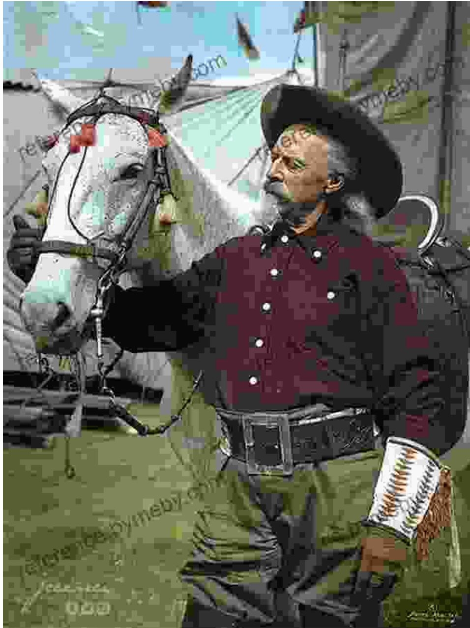
Buffalo Bill: A Symbol of the Wild West Spirit

Wild West' unveils the extraordinary life of this larger-than-life figure, showcasing his adventures as a frontiersman, his role in the Pony Express, and his enduring legacy as an American icon.